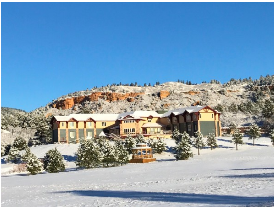
A photo of the MTI facility during this program. Snow in the morning, Sun in the afternoon

October - November 2017 Update from the Brakes