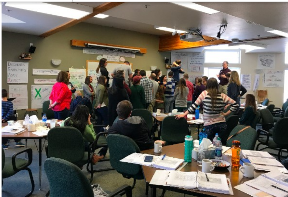
a snapshot of one of our active training modules